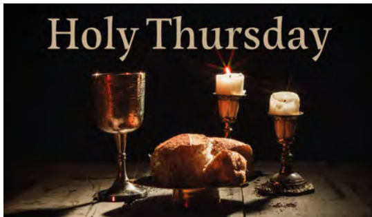
Holy Thursday | March 28 12pm and 6:30pm services in the sanctuary