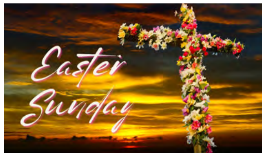
Easter Sunday | March 31 8:45 and 11am services in the sanctuary

Invite your friends and family to our Holy Week events!