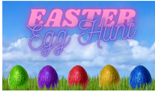
Easter Egg Hunt | March 24 12-1pm in the courtyard and front lawn