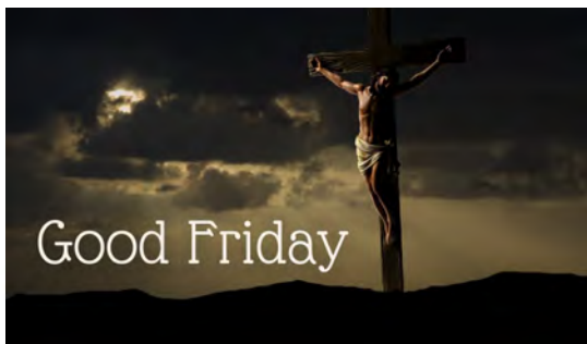
Good Friday | March 29 7pm service in the sanctuary