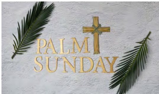
Palm/Passion Sunday | March 24 8:45 and 11am services in the sanctuary