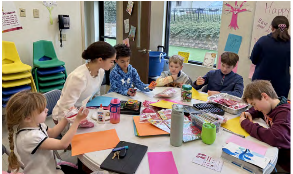
The children's Sunday School class hard at work making Valentine's Day cards.

Parents and grandparents, this is a wonderful opportunity to talk with