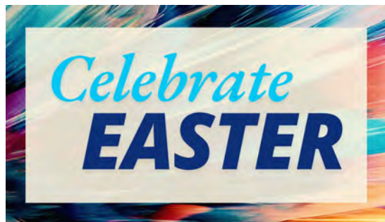
Easter Sunday | April 20 8:45 and 11 a.m. services in the Sanctuary

Invite your friends and family to our Holy Week events!