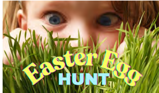
Easter Egg Hunt | April 13 12-1 p.m. in the courtyard and front lawn