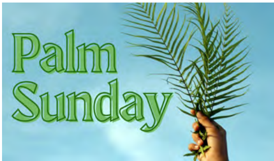
Palm/Passion Sunday | April 13 8:45 and 11 a.m. services in the Sanctuary