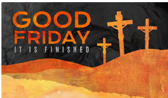
Good Friday | April 18 7 p.m. service in the Sanctuary