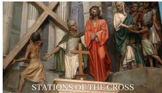
Stations of the Cross | April 18 10 a.m. to 3 p.m. in the Fellowship Hall