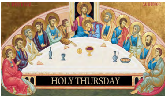
Holy Thursday | April 17 12 and 6:30 p.m. services in the Sanctuary